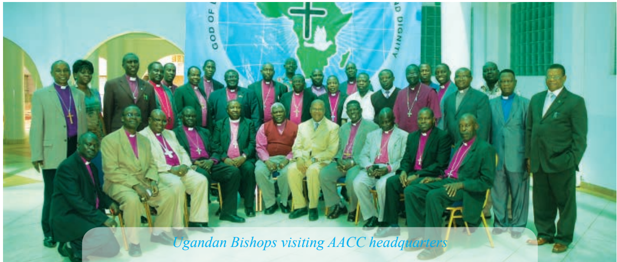
Ugandan Bishops visiting AACC headquarters