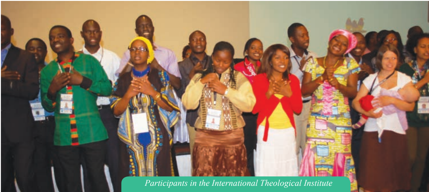
Participants in the International Theological Institute

It will be important to work hand in hand with the Ecumenical Disability Advocates Network (EDAN) to sensitise and advocate for the dignity of people living with disabilities.