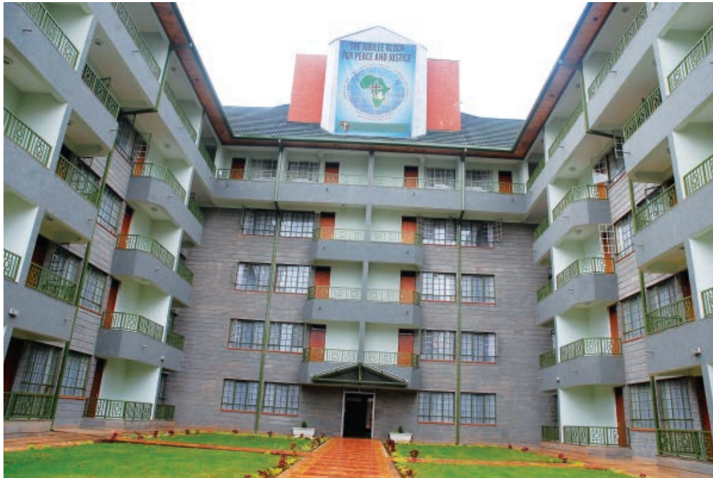
AACC Jubilee Block for Peace and Justice at Desmond Tutu Conference Centre