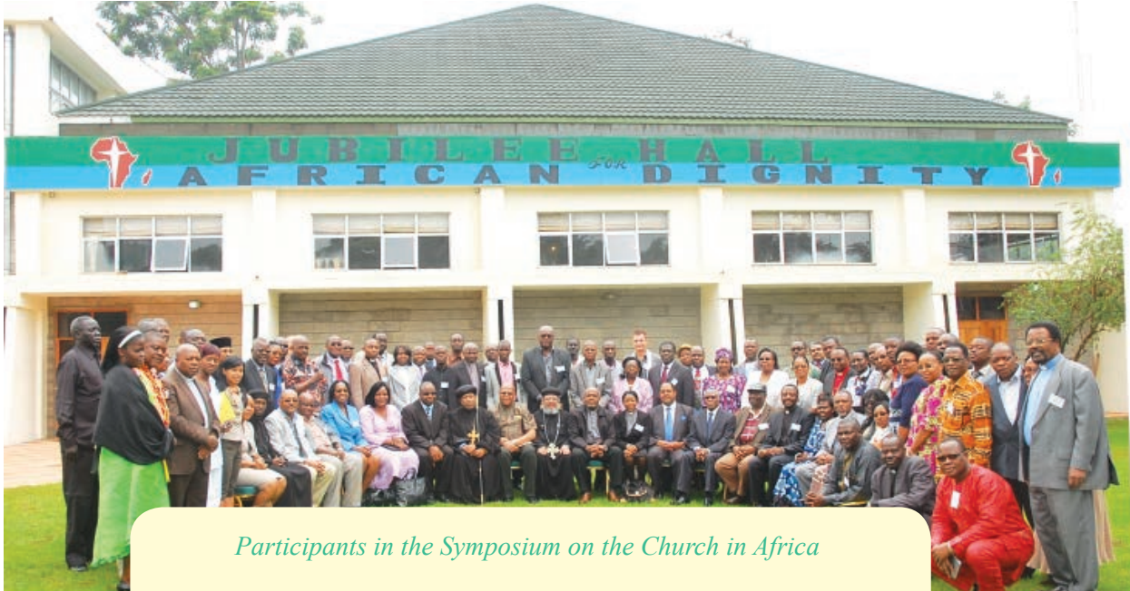
Participants in the Symposium on the Church in Africa

The Office of the General Secretary has the overall responsibility of coordination and management of the organization including the regular meetings of the governing bodies.