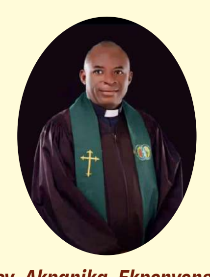
Rev. Akpanika, Ekpenyong Nyong Moderator of the General Assembly of the Presbyterian Church of Nigeria (PCN)