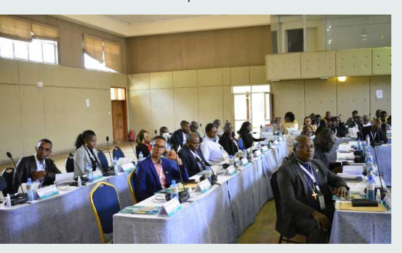
Participants of the 4th Misleading Theologies Symposium keenly following on the proceedings of the symposium

Participants acknowledged that God is the source of power and authority and the purpose of the power is for Christians to be witnesses to Christ and enhance the gospel's propagation (Mat 28:18 20). However, some clergy have been abusing power in religious practices and have instrumentalized power to exclude others.