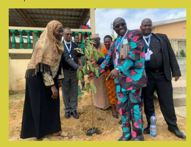
Members of the AACC's Africa Faith Actors Network planting a tree during the Africa Climate Week in Gabon.

The delegation paid courtesy visits to local faith leaders who included AACC member churches and the Muslim Community. The visits were hugely appreciated by local faith leaders who also shared their solidarity messages on the work of faith leaders on climate change. Trees were planted as a show of commitment to creation care.