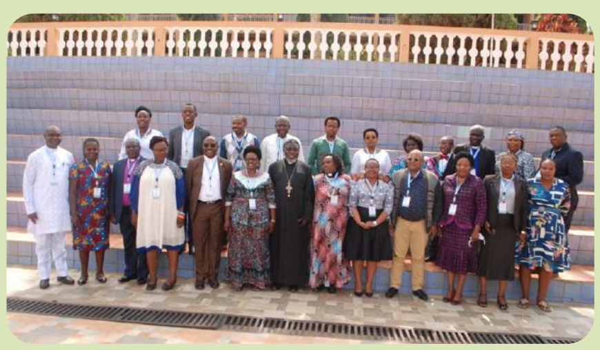
Group photo of the theological round table meeting participants

The AACC held a Theological Round Table Meeting on Population and Demographic Dividend in Africa at the Hotel Africana from the 25th July 2022 to the 28th July 2022, under the theme: "Affirming the faith by taking care of the household" 1 Timothy 5:8. The meeting drew delegates from the AACC membership which included ecclesial officers, theologians, the youth and those in Diakonia services.