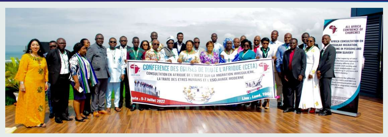
Group photo of the attendees of the West Africa Consultation on Irregular Migration, Trafficking in Persons, and Modern Slavery at the El Doria Hotel Lomé.

In its pursuit of human dignity, the AACC organised a Consultation on Irregular Migration, Human Trafficking, and Modern Slavery for its constituents in West and Central Africa from the 5th to the 7th of July 2022 at El Doria Hôtel Lomé, Togo.