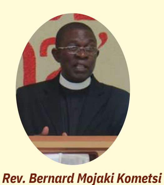
Moderator of the Lesotho Evangelical Church in Southern Africa Lesotho