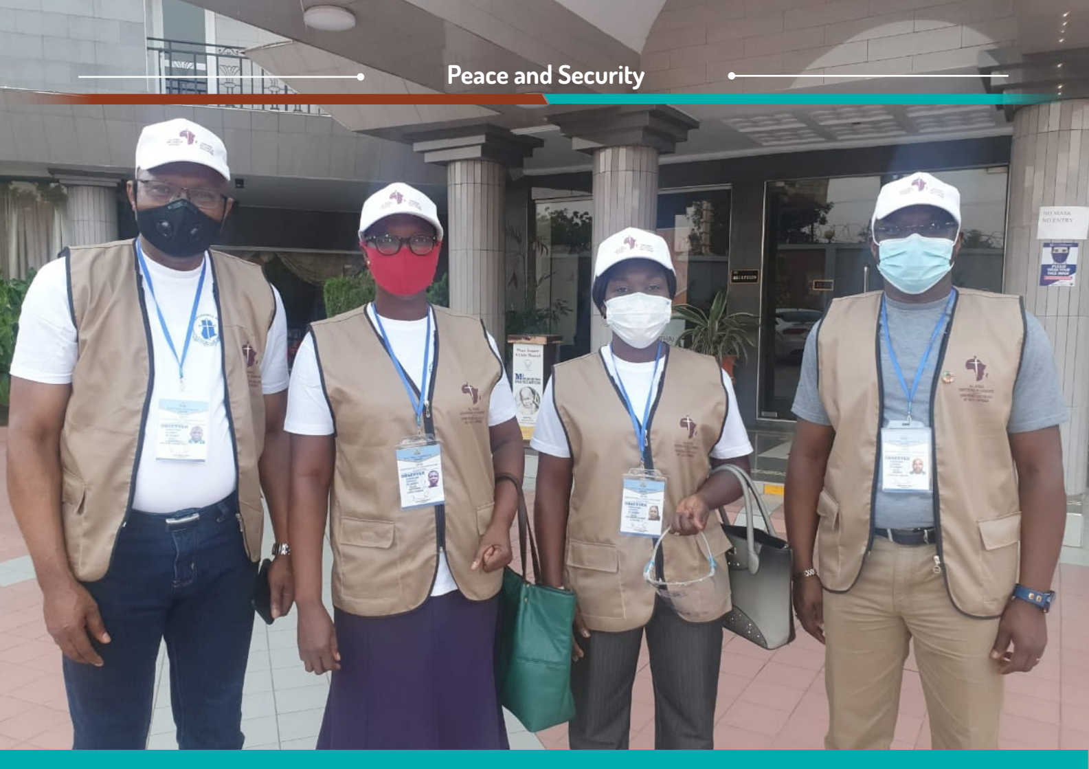
The team of AACC staff as international observers in Ghana, December 2020

the "Data Gathering Room", "the Analysis Room", the "Communication Room" and the "Decision Room".