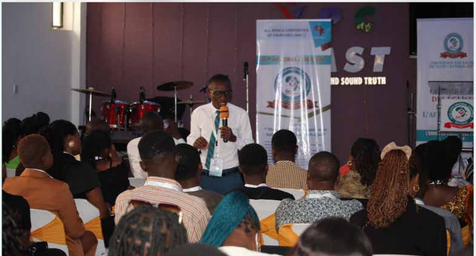
AACC Executive Secretary, Youth facilitating the conversation

Brian spent time challenging the participants to transform cultural and religious values, practices, and norms that increase the abuse of Sexual and Reproductive Human rights, and all those that limit the sexual and reproductive health of young people in Africa.