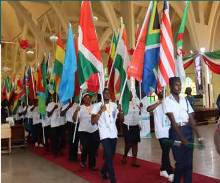
Flag procession led by the stewards