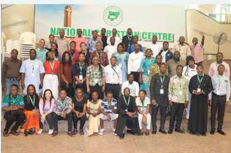
9 th Theological Institute students at the 12 th GA venue.