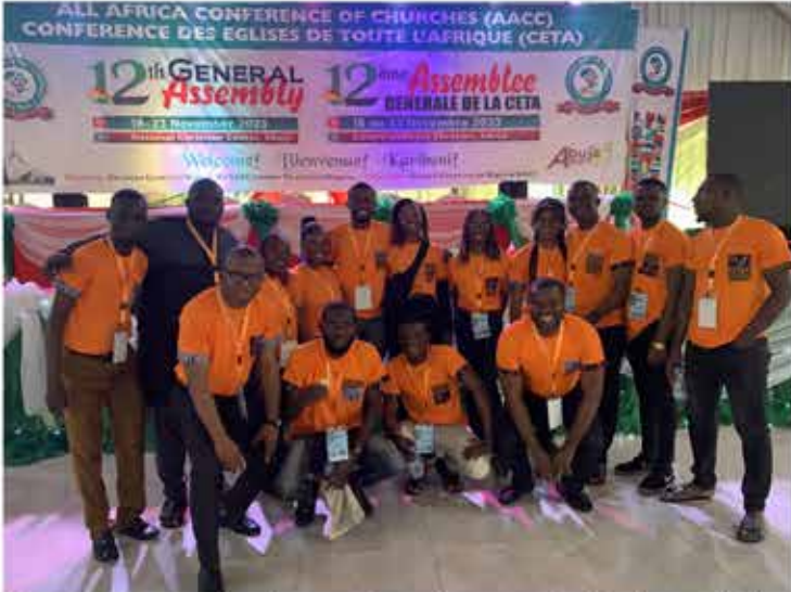
Some of the stewards posing for a photo after preparing the plenary hall