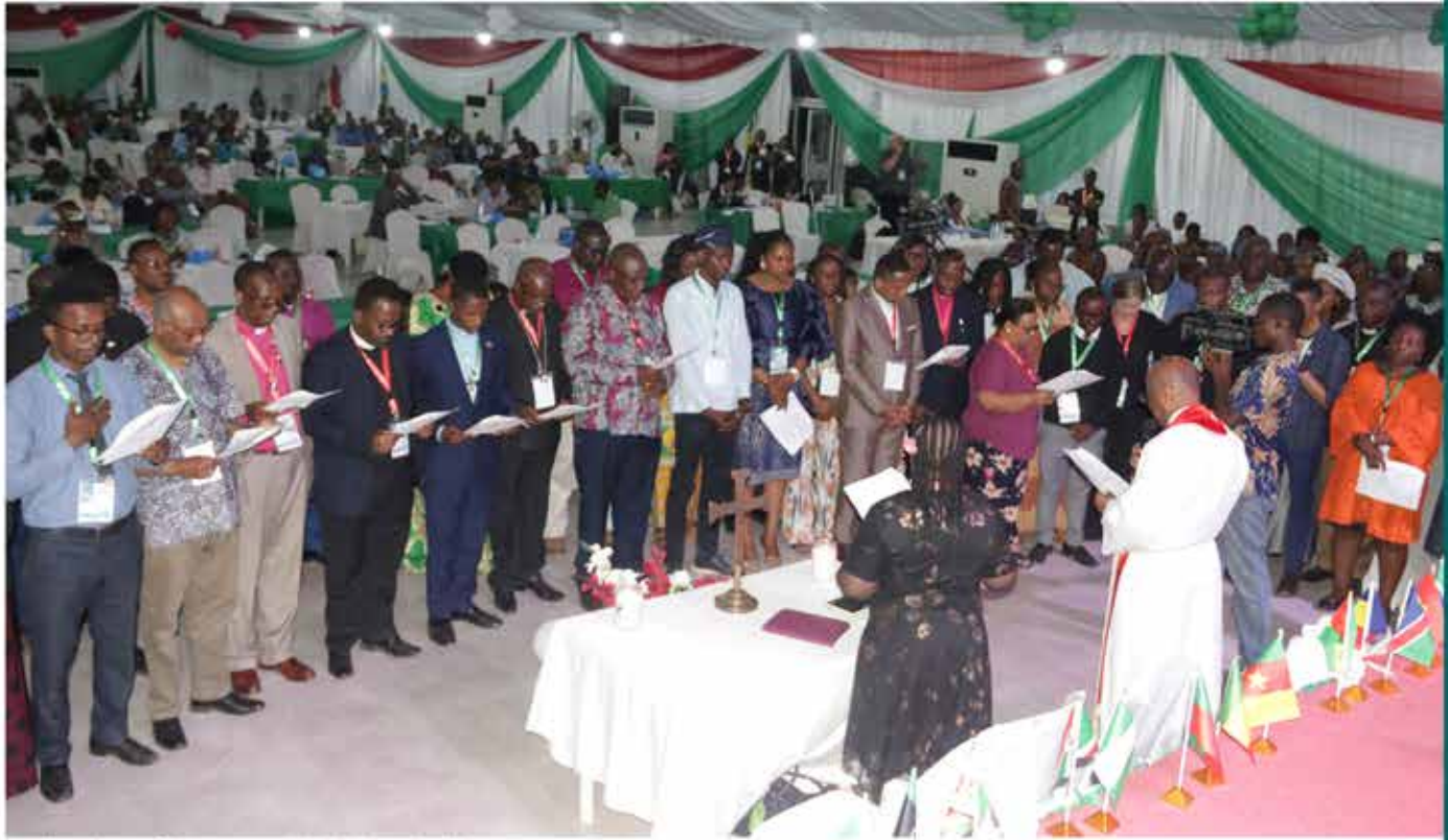
Induction of the new AACC leadership