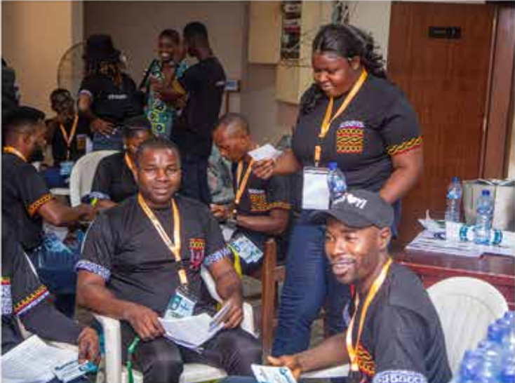
Some of the stewards on duty