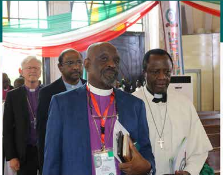
AACC President and General Secretary followed by WCC President and General Secretary in the procession