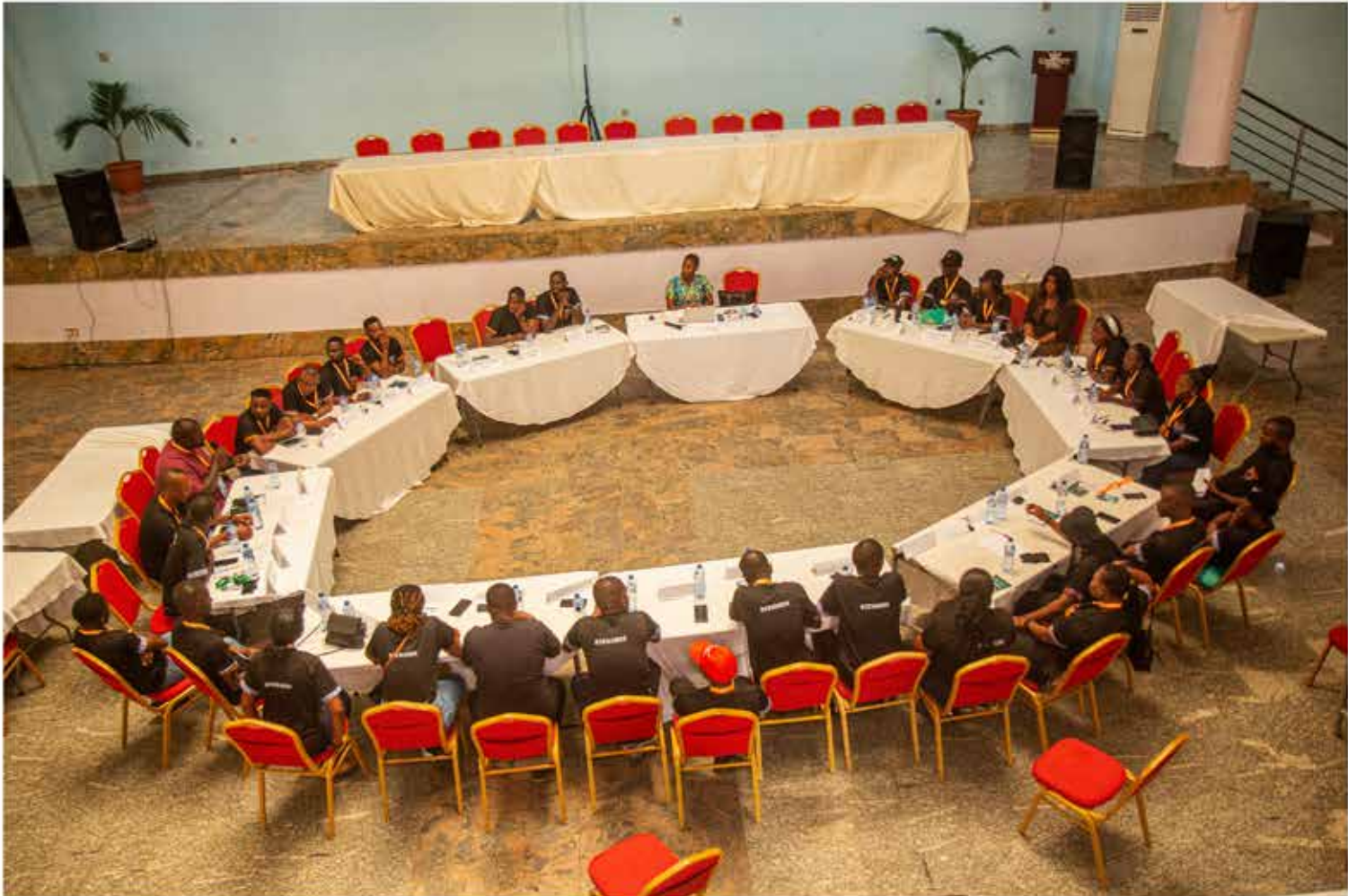
Stewards having a round table conversation to share roles and responsibilities