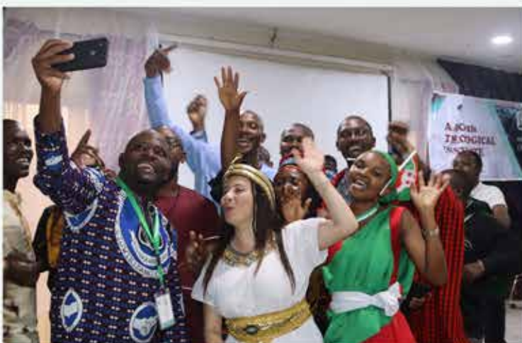
A light moment as 9 th Theological Institute students pose for photos during the culture night.