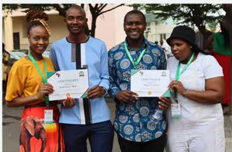
Students showing off their certificates.