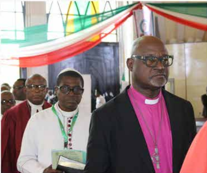
Some of the Heads of the AACC member churches in Nigeria during the procession