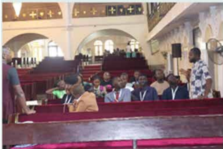
Group discussions at the Pre-assembly