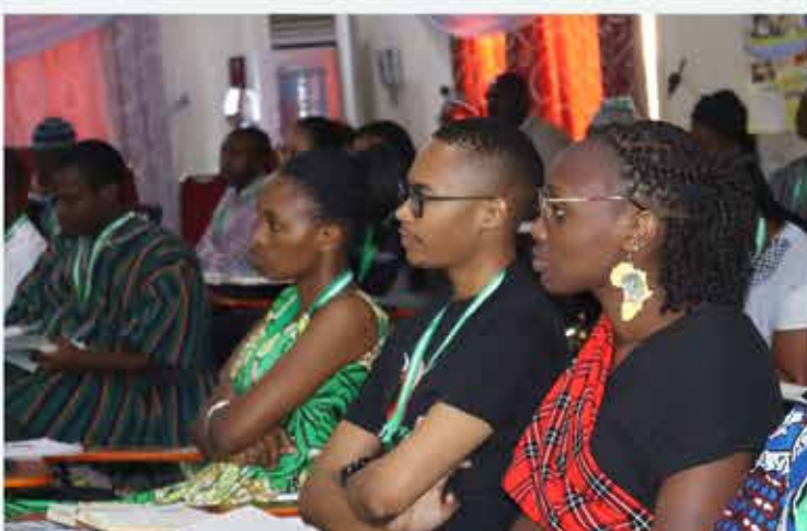
Some of the students during a lecture