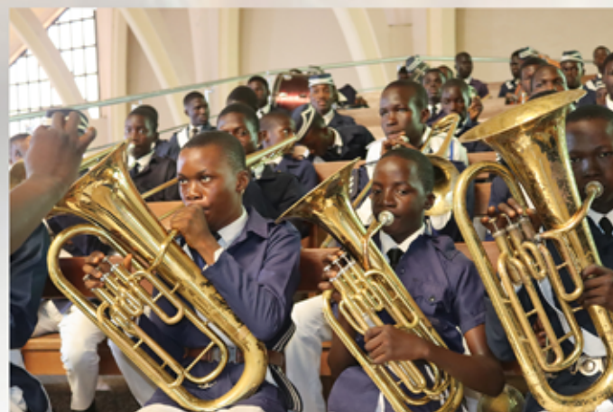
Band performance during the anniversary

"In this celebration, we draw the inspiration to keep us focused and determined to build the Africa we want: An integrated, prosperous and peaceful Africa, driven by its own citizens, representing a dynamic force in the international arena by 2063."