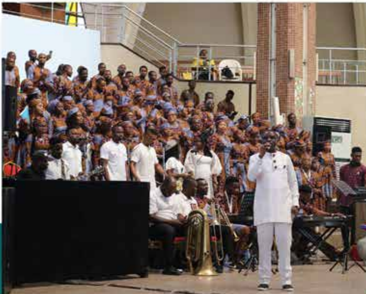
Performance by the mass choir