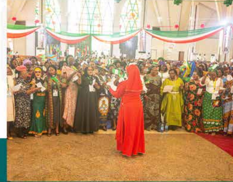
A performance of the womens choir